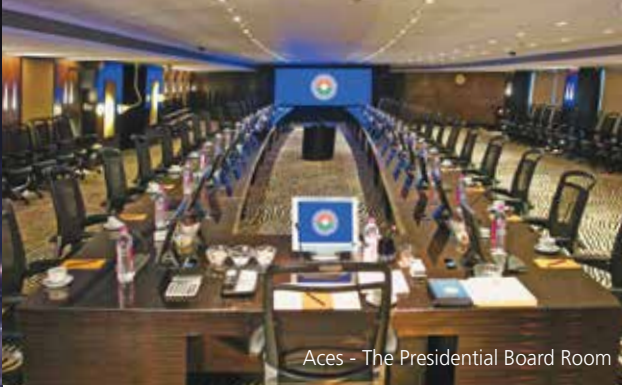
Aces - The Presidential Board Room