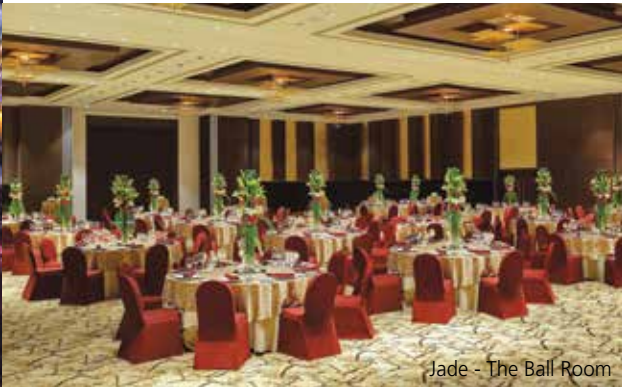
Jade - The Ball Room