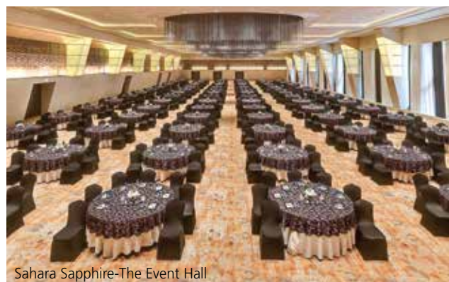
Sahara Sapphire-The Event Hall

It has technologically advanced boardroom known as Aces, that can seat up to 77 delegates. The boardroom is equipped with all the latest conference facilities including a 4-screen Barco