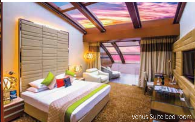
Venus Suite bed room

amazing colour wash and spectacular customised effects to the glass facade.