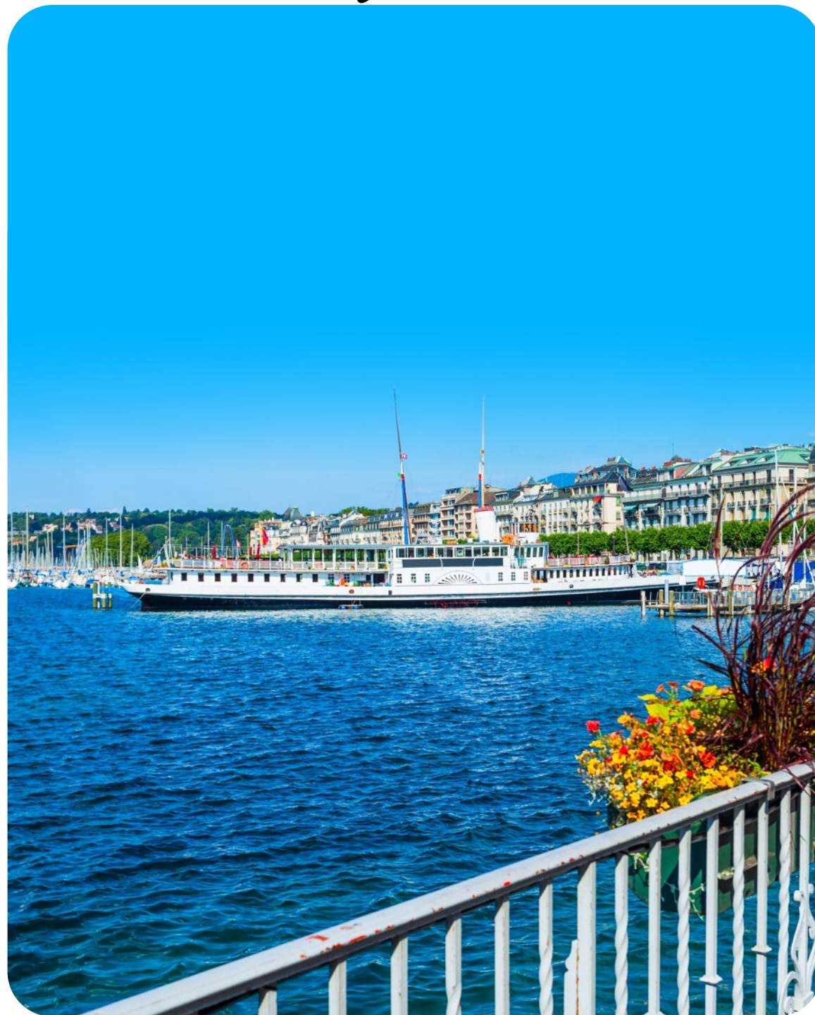
LAKE GENEVA CRUISE

No visit to this region is complete without experiencing a Lake Geneva Cruise.