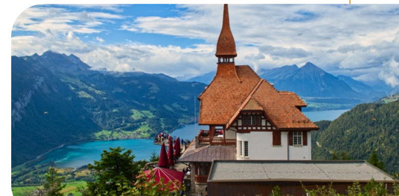
Dinner Atharder Kulm Mountain, Interlaken

In Interlaken, you have a day at leisure to choose from a wide range of activities. Adventure activities like Skydiving, Rafting and Paragliding to family activities like Hot Air Balloon or an excursion to Jungfrauoch – the Top of Europe.