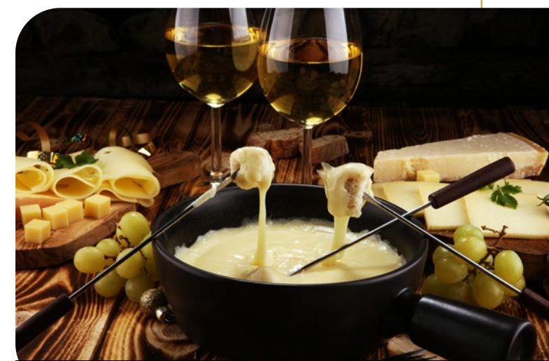
Swiss Fondue Dinner