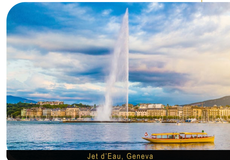
Jet d'Eau, Geneva