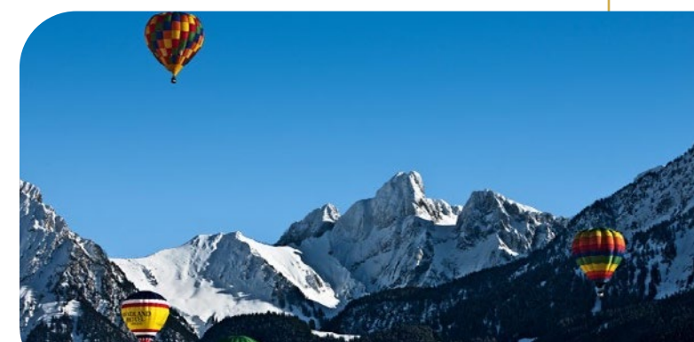
Hot Air Balloon Interlaken