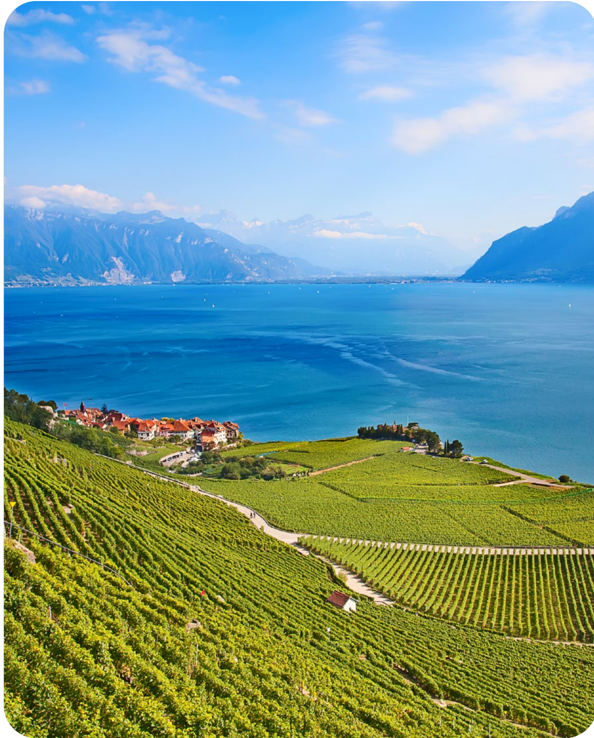
LAVAUX WINE TERRACES WITH TASTING

The Lake Geneva Region provides some of the most diverse landscapes in Switzerland.