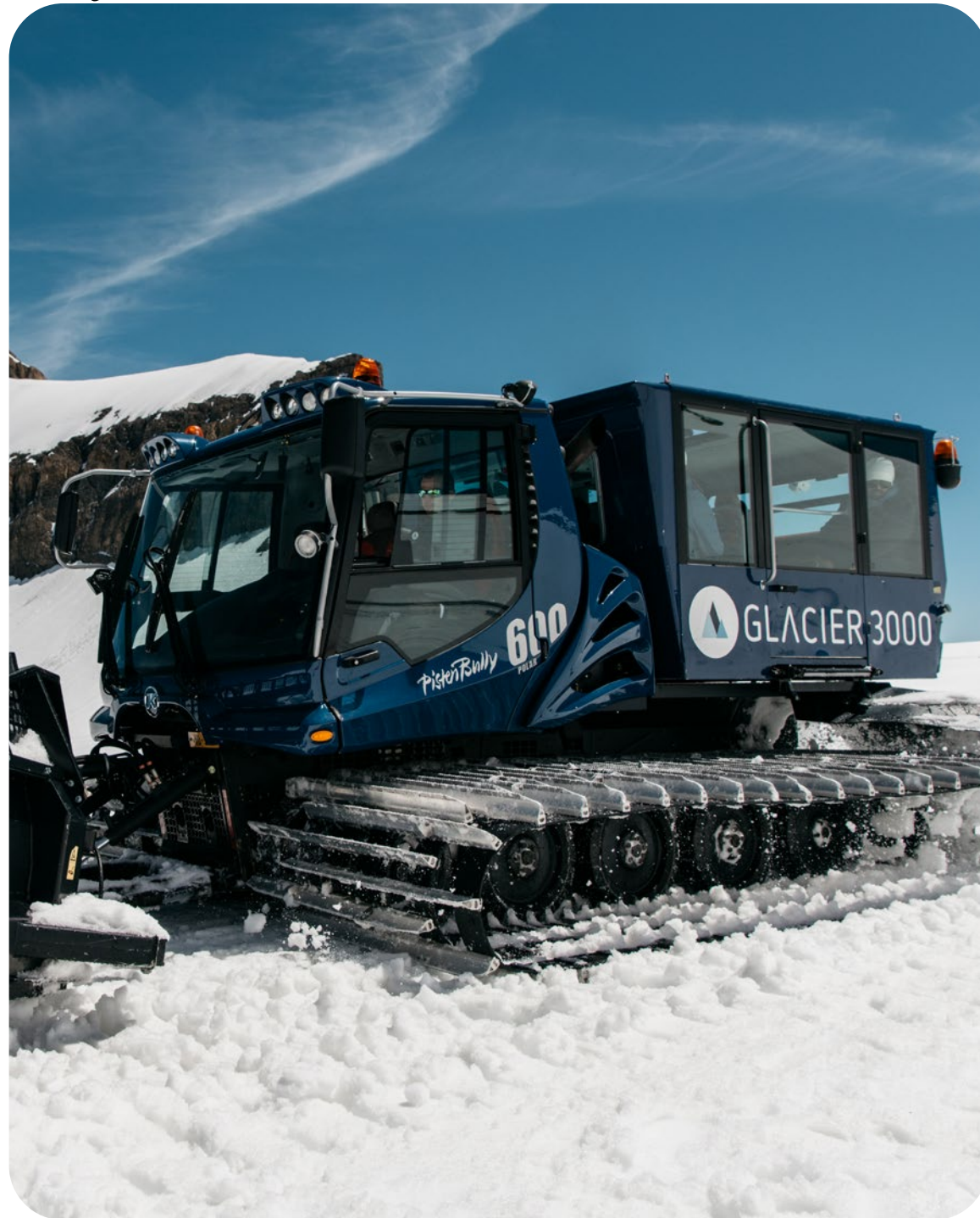
GLACIER 3000 SNOW BUS

Visit one of Switzerland's mountains that offer the widest range of activities.