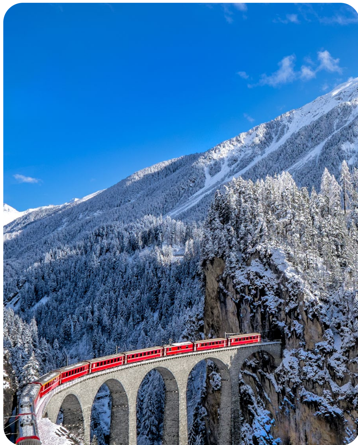
GLACIER EXPRESS FROM ANDERMATT TO ZERMATT

Your experience in Switzerland starts with you meeting your chauffeur at the Airport who will drive you in your private car to the hotel. Here, meet your Tour Director who will facilitate your check in (check in time is 1400 hrs).