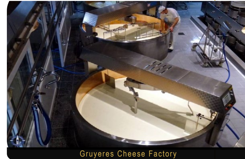
Gruyeres Cheese Factory

After spending some time exploring the village – board the Golden Pass Train – one of Switzerland's most eye-popping journeys - to Montreux.