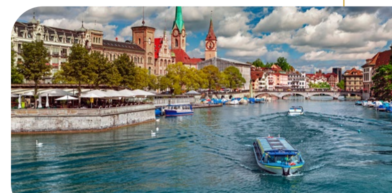
Bruch Cruise on Lake Zurich