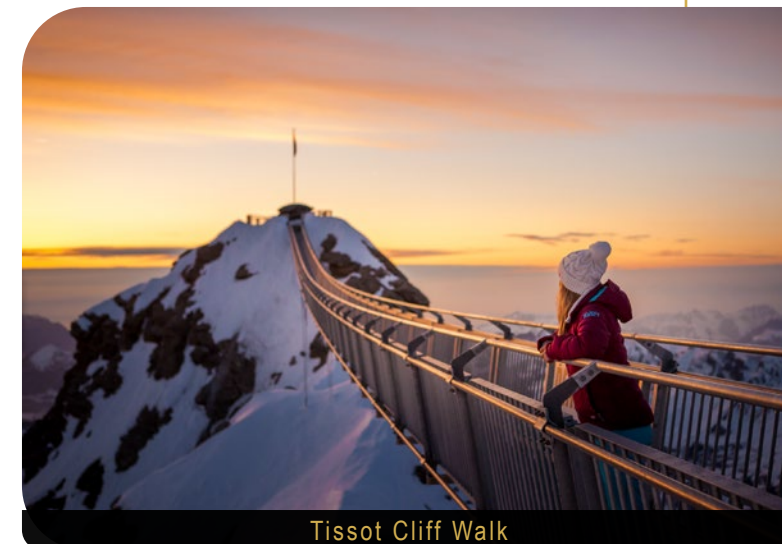
Tissot Cliff Walk