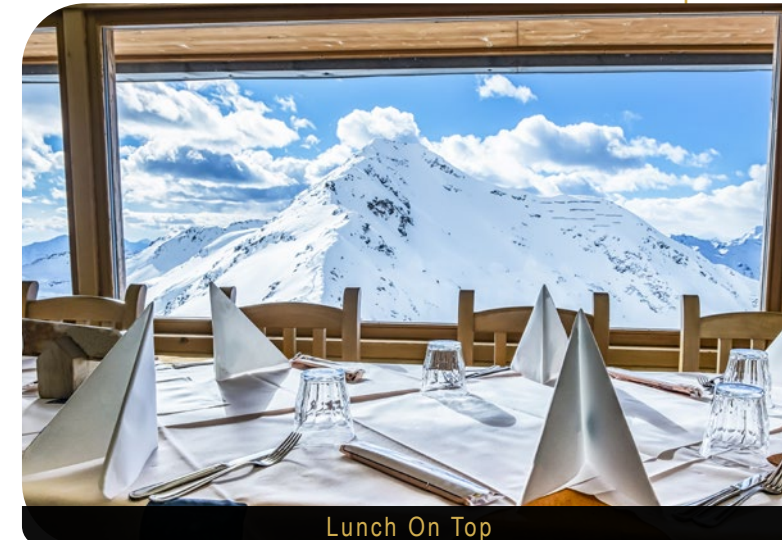
Lunch On Top