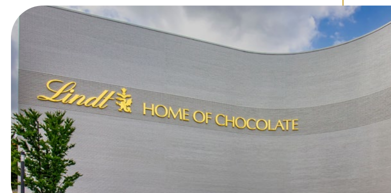
Lindt Chocolate Experience