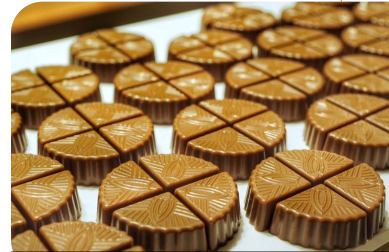
Cailler Chocolate Factory