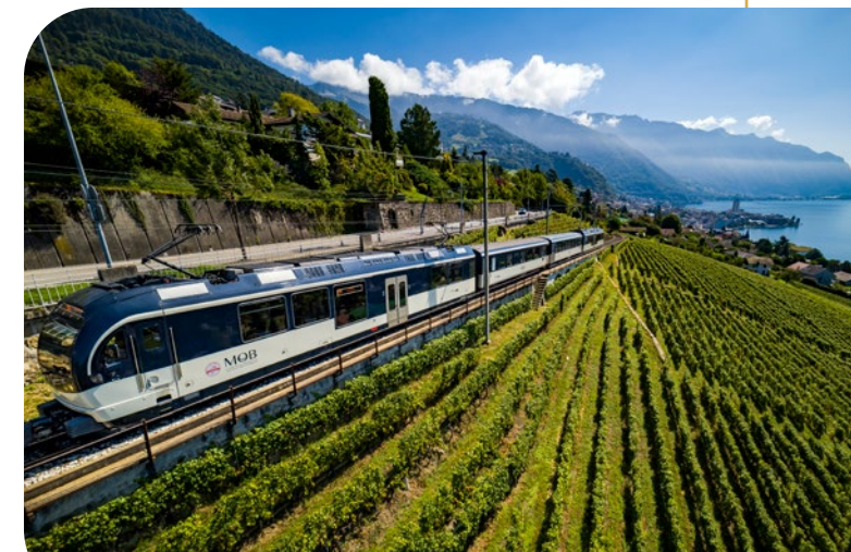
Golden Pass Train