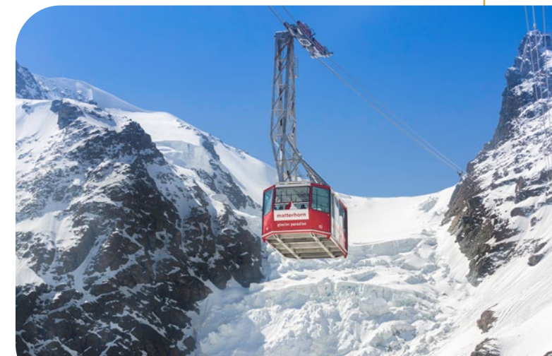
Matterhorn Glacier Paradise

To complete your Zermatt experience – enjoy a traditional Swiss Fondue Dinner.