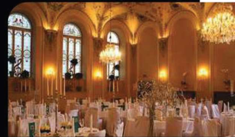
DINNER AT THE ICONIC STIFTSKELLER ST. PETER

In true Salzburger style – visit the Augustiner Brewery. This 600 year old brewery is still run the monks.