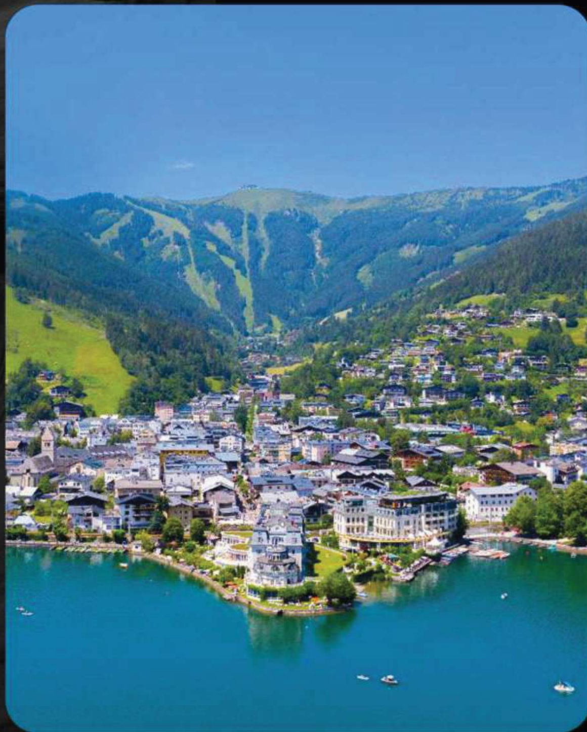
Zell am See

Zell am See is an instant heart-stealer, with its bluer-than-blue lake (Zeller See), pocket-sized centre studded with brightly painted chalets, and the snowcapped peaks of the Hohe Tauern that lift your gaze to postcard heaven.