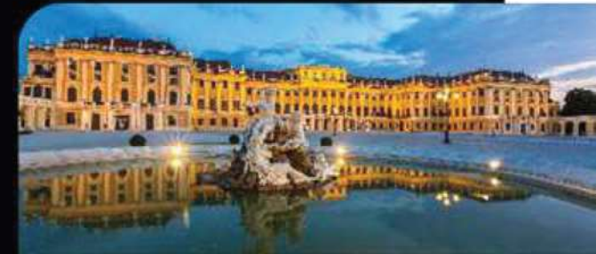
GUIDED TOUR OF SCHOENBRUNN PALACE