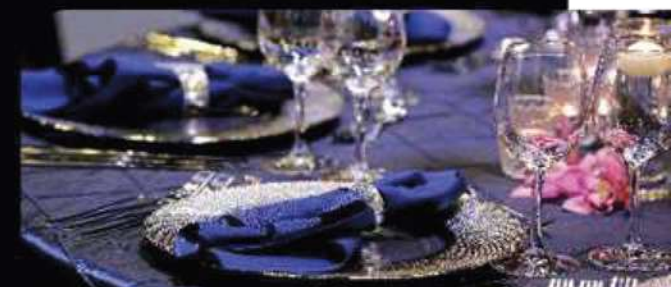
3 COURSE DINNER AT THE RENAISSANCE VIENNA