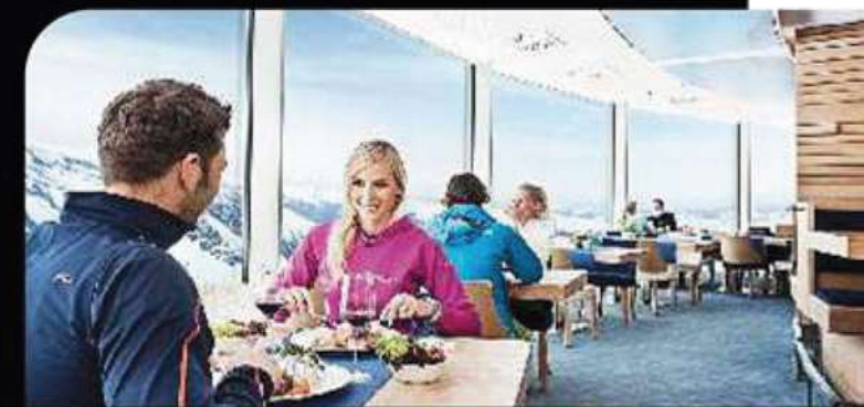
LUNCH AT GIPFEL KITZSTEINHORN @ 3029MTRS

No Zell am See experience is complete without a cruise on the lake and a stroll around this charming Old Town