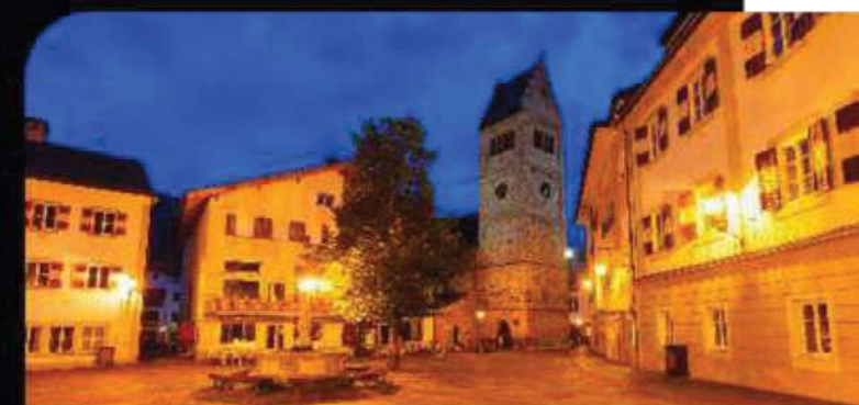
EXPLORE THE OLD TOWN