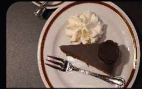
SACHER TORTE & COFFEE AT SACHER BAKERY