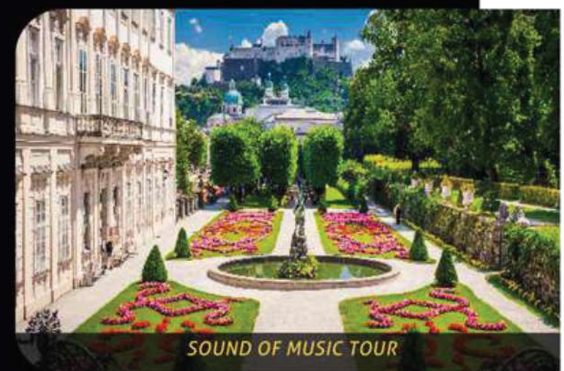
SOUND OF MUSIC TOUR