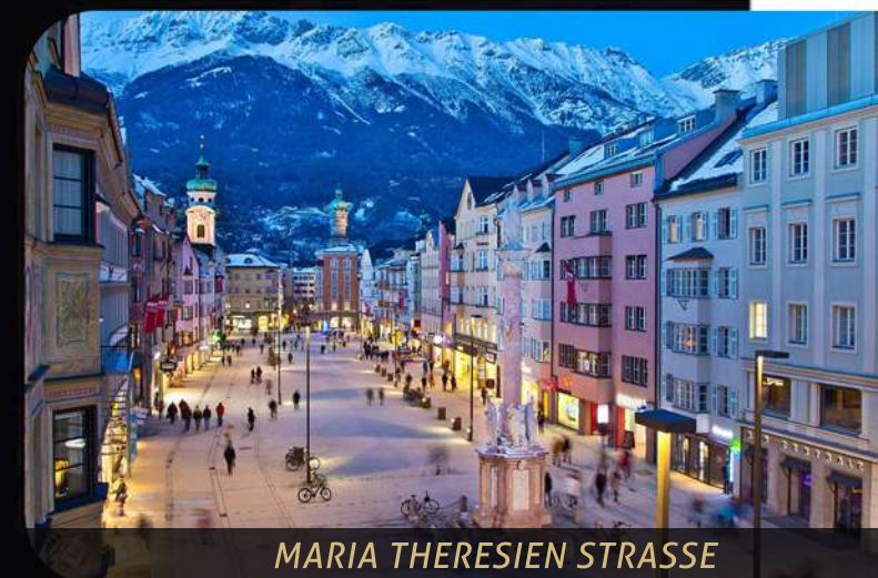
MARIA THERESIEN STRASSE