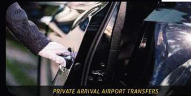
PRIVATE ARRIVAL AIRPORT TRANSFERS

You will also see the magnificent St Stephens Cathedral and explore great shopping opportunities in Graben – a pedestrian shopping area.