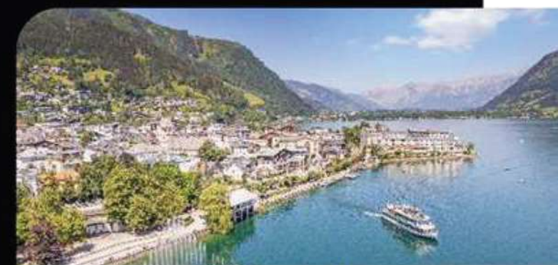
CRUISE ON THE LAKE