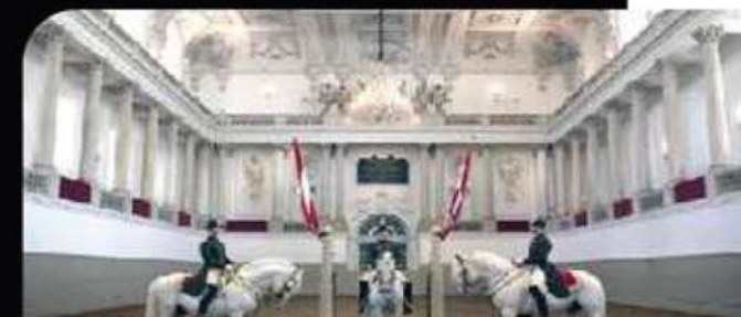
SPANISH RIDING SCHOOL – TOUR & SHOW