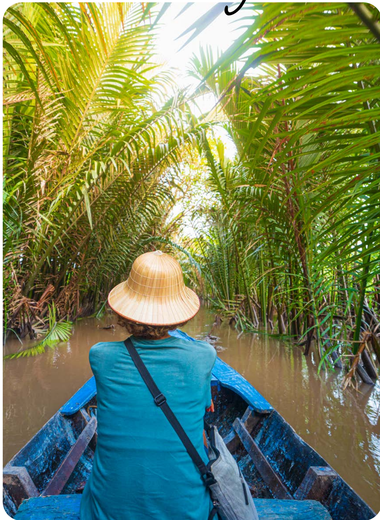
MEKONG DELTA TOUR