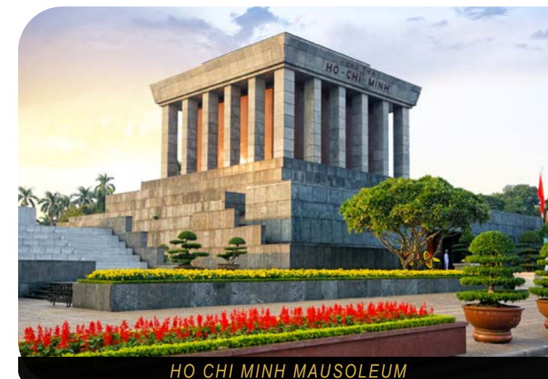
HO CHI MINH MAUSOLEUM