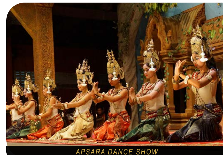
APSARA DANCE SHOW