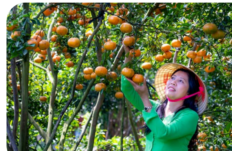
MEKONG DELTA FRUIT FARM