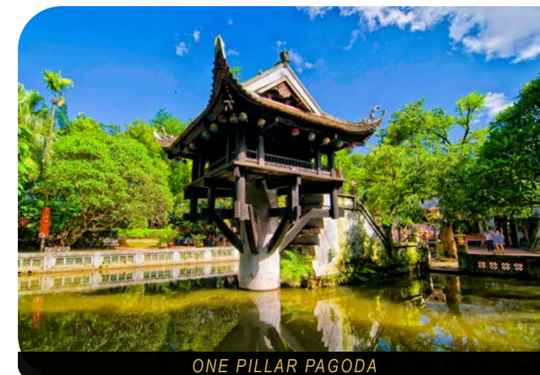
ONE PILLAR PAGODA