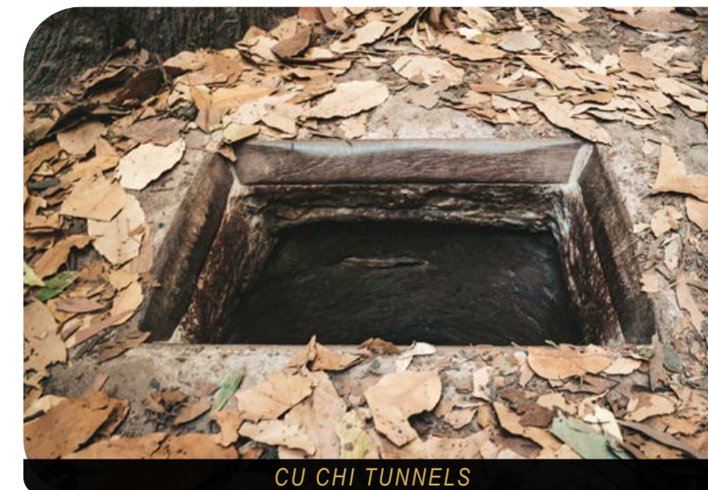
CU CHI TUNNELS

Today, after breakfast, board your Private Van and proceed with a Private Guide to visit the Cu Chi Tunnels - one of the most famous and historical aspects of the Vietnam War. Here, explore the winding, underground network of tunnels. See the exhibition of weapons and booby traps, visit different underground bunkers featuring kitchens, meeting rooms, ammunition depots and hospitals. Later, in Ho Chi Minh – on a guided tour, see historic landmarks like the Reunification Palace, Dong Khoi Street, classic European-landmarks such as the ornate City Hall (Hotel De Ville), the neo-Romanesque Notre Dame Cathedral and pay a visit to the Central Post Office designed by famous architect Gustave Eiffel. Overnight in Ho Chi Minh. (B)