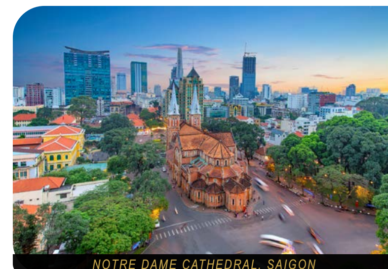
NOTRE DAME CATHEDRAL, SAIGON