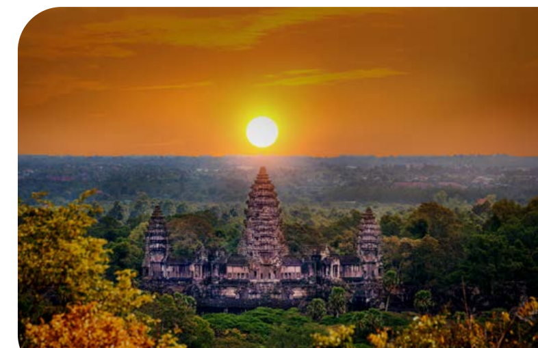
ANGKOR WAT SUNSET

Today, after breakfast on board, board your Private Van and proceed to Noi Bai Airport in Hanoi for your flight to Siem Reap - Cambodia, the gateway to the Angkor Temples Complex. On arrival, you will be met by your private Chauffeur outside the customs area, who will welcome you and take you to your hotel. Overnight in Siem Reap. (B)