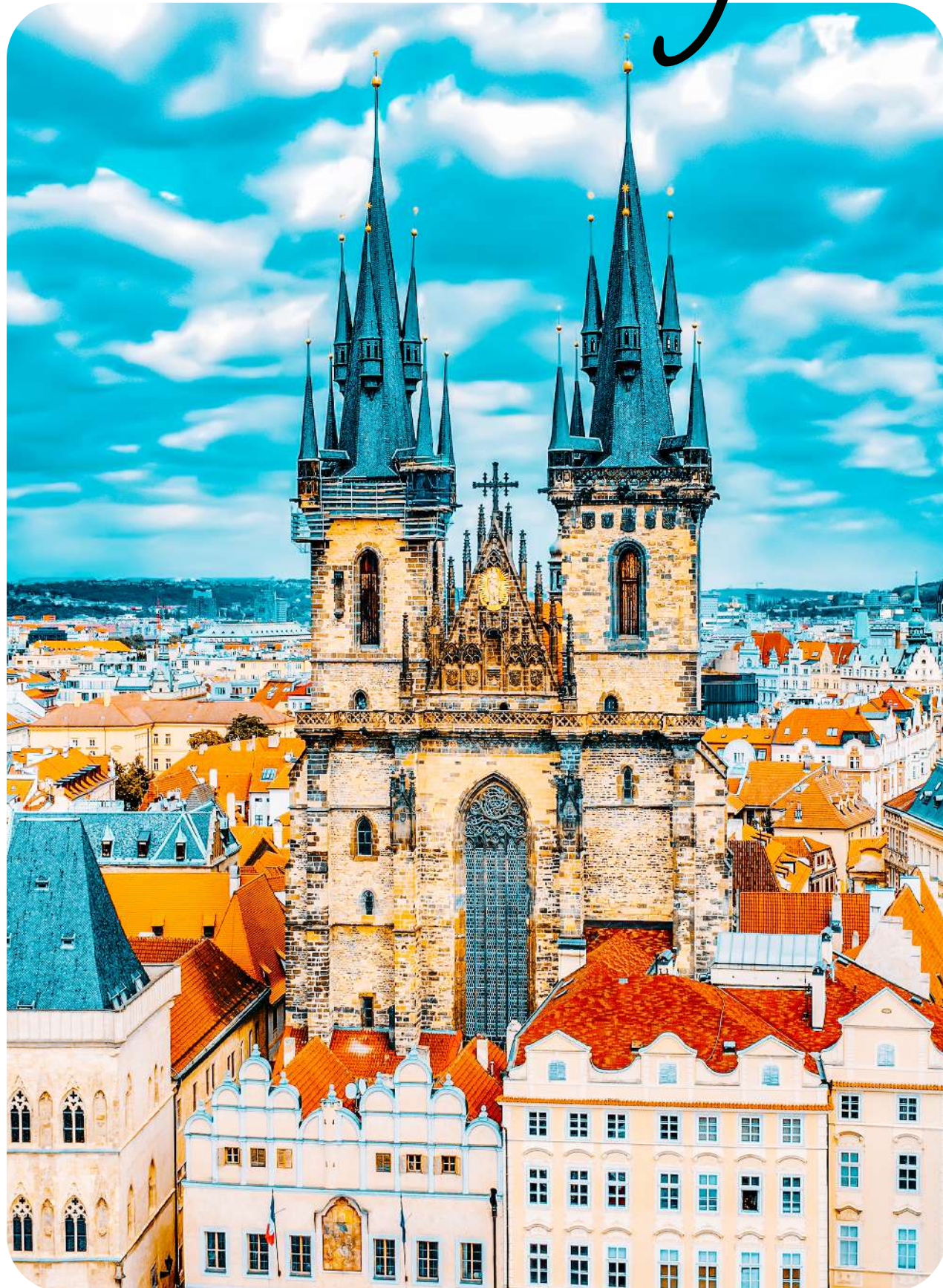
Prague Old Town