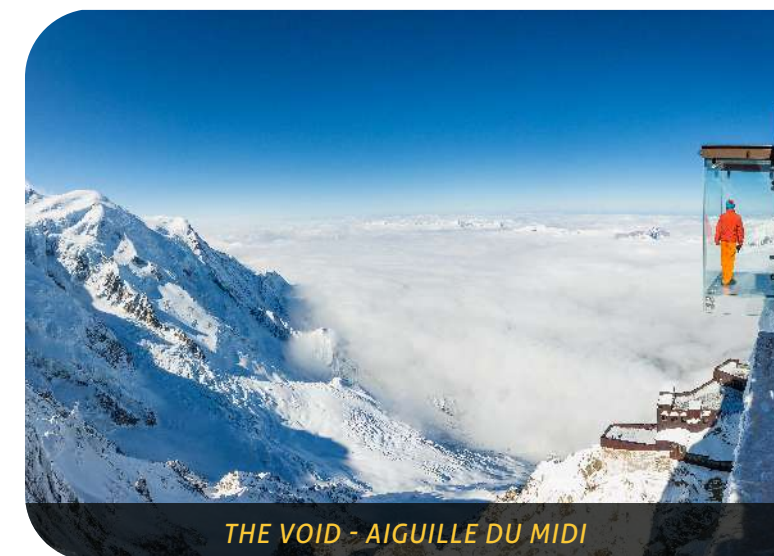
THE VOID - AIGUILLE DU MIDI