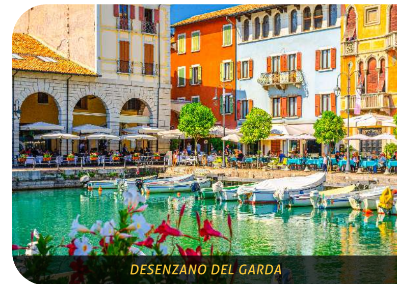
DESENZANO DEL GARDA

Today, after breakfast, board your private van and proceed to the Airport for your flight home. We hope you take back many happy memories of your holiday. (B)