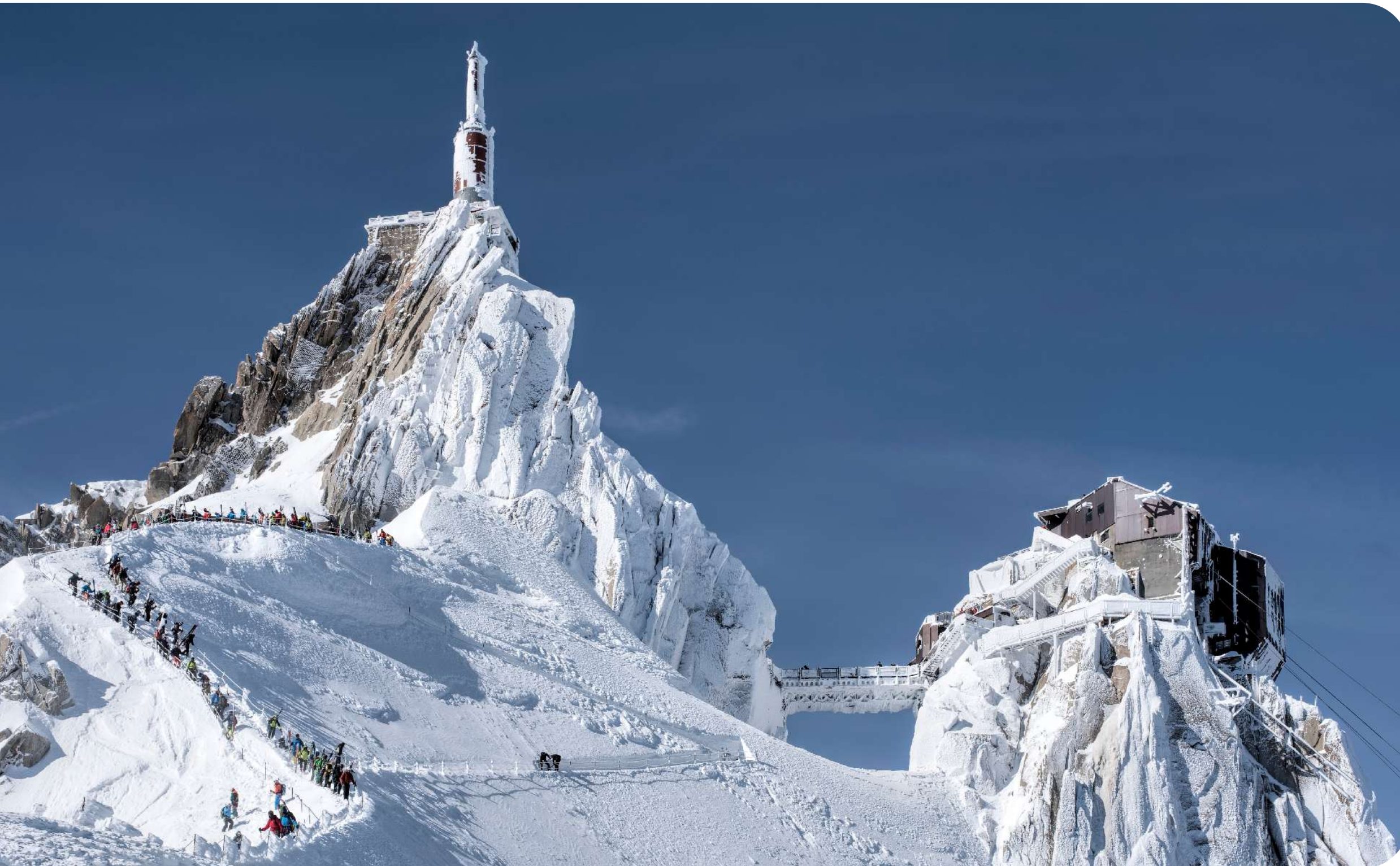
Aiguille du Midi

“Whether travelling with friends or family - this Private Chauffeur Driven Holiday will ensure that you enjoy yourselves to the maximum.