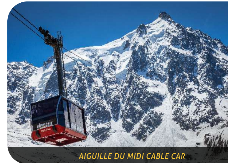
AIGUILLE DU MIDI CABLE CAR

Today, after breakfast, board your private van and proceed to the Aiguille du Midi cable car station. On arrival, take the cable car to a height of 3,842 m. The laid-out terraces offer a 360° view of the French, Swiss and Italian Alps. Take a lift to the summit terrace, where you will have a clear view of Mont Blanc. Later, explore the beautiful resort town of Chamonix, on your own. Walk down the streets lined with Michelin-starred restaurants, sports gear stores and some of the French Alps' fanciest hotels. Overnight in Chamonix. (B)