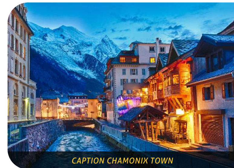
CAPTION CHAMONIX TOWN