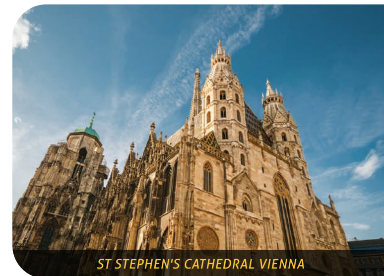
ST STEPHEN'S CATHEDRAL VIENNA