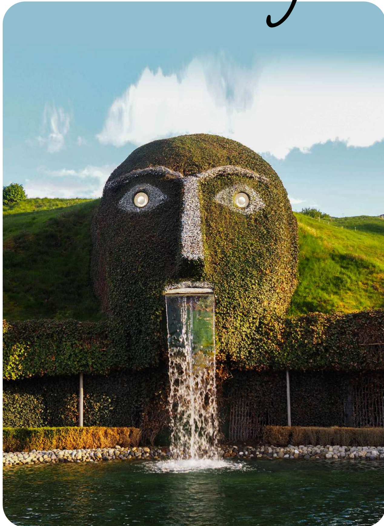
Swarovski Crystal World, Wattens