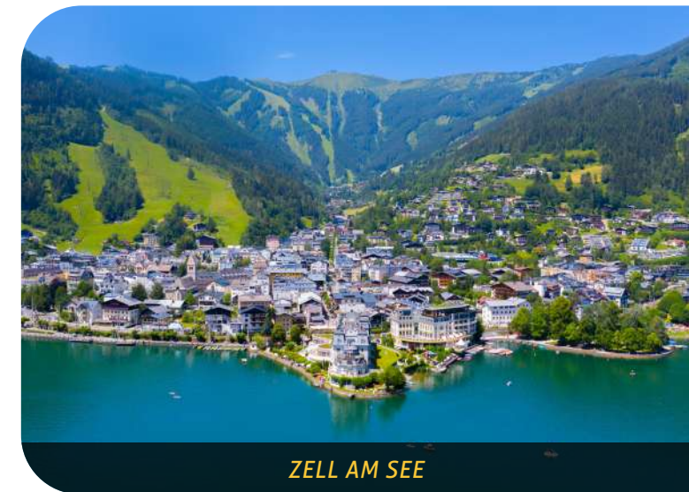
ZELL AM SEE

Today, after breakfast, board your private van and drive to Hallstatt - Austria's oldest and possibly most photographed village. On arrival, experience a ride on the Hallstatt Funicular. Once on top visit the "Skywalk" which hovers 350 meters above the roofs of Hallstatt and offers a unique panoramic view over Lake Hallstatt and the impressive mountain scenery. Later, drive to Zell Am See an instant heart-stealer, with its bluer-than-blue lake, pocket-sized centre studded with brightly painted chalets and the snowcapped peaks of the Hohe Tauern. Overnight in Zell Am See. (B)