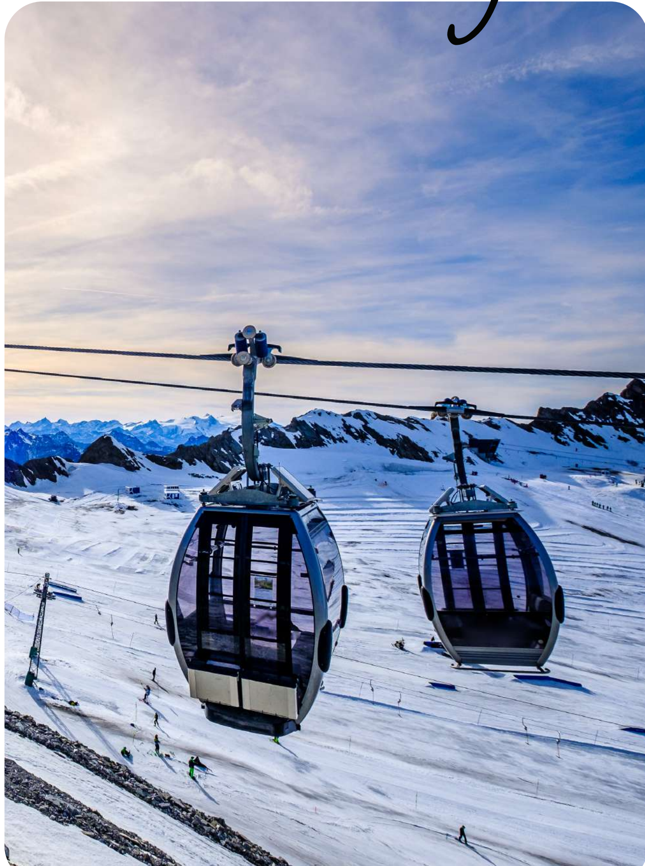
Kitzsteinhorn Glacier Cable Car