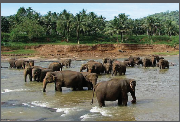
Pinnawala Elephant Orphanage