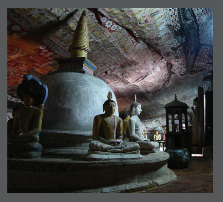
Dumbulla Buddha Stupa