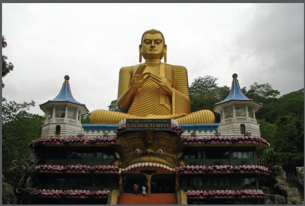
Dambulla Golden Temple