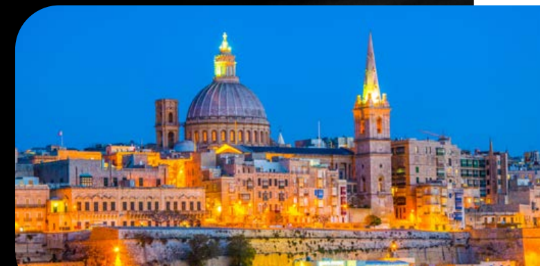
Guided Tour of Valletta

In Valletta you also enjoy 2 dinners in the luxury of your hotel.