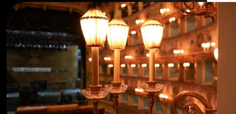
Behind The Scenes Opera House Tour