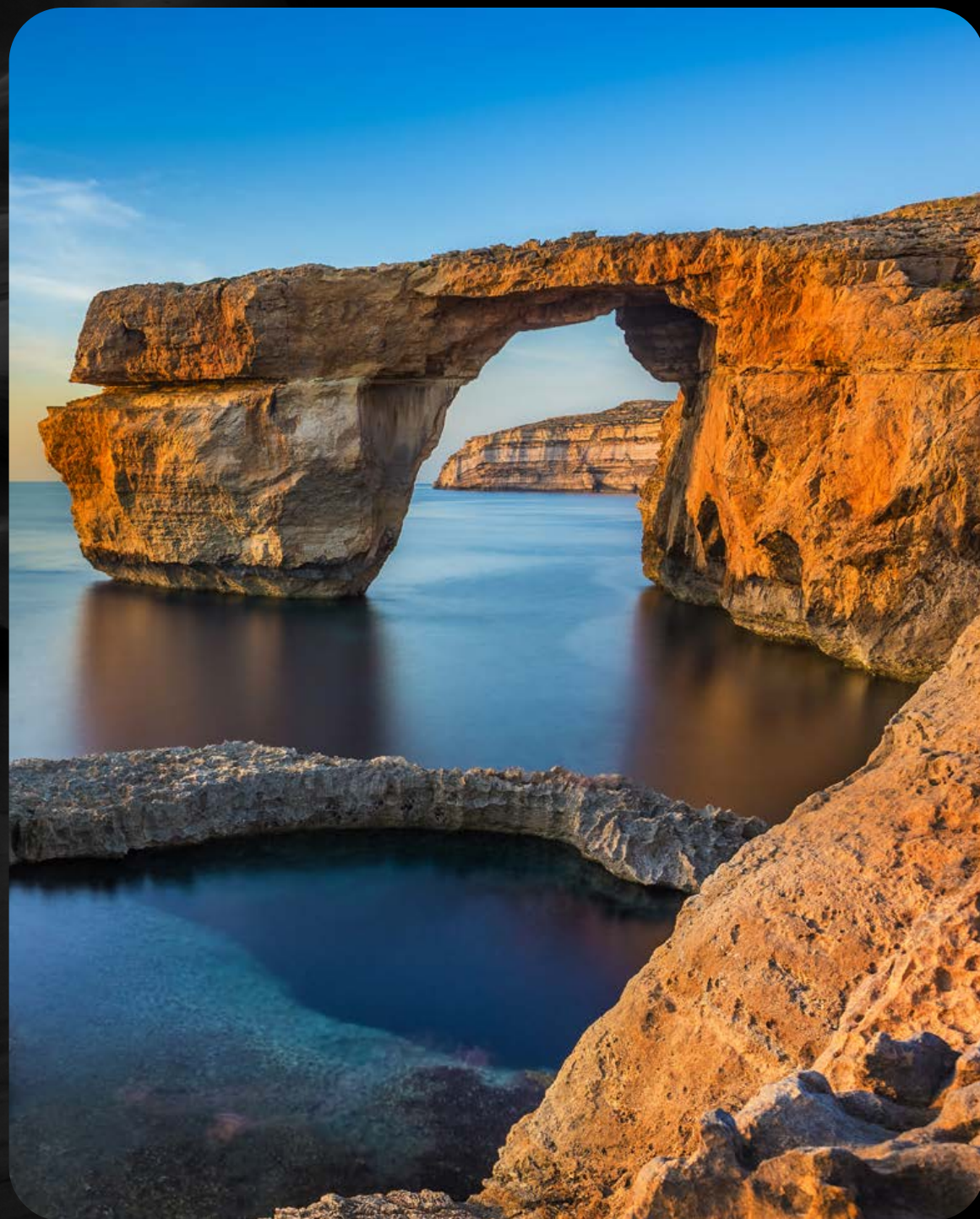
AZURE WINDOW, GOZO ON GOT TOUR

As you stay at the Luxurious Grand Excelsior hotel, your Maltese experience will take you through a memorable range of experiences starting with a high Speed Boat from Italy – Valletta – the capital of Malta in just 1.45 hrs.