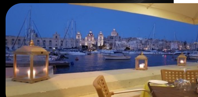
Dinner at Paranga Restaurant