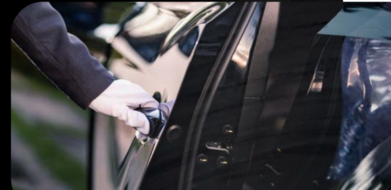
Private Arrival Transfer

In Segesta – which is set on the edge of a deep canyon amid desolate mountains, see the 5th-century BC ruins, among the world's most magical ancient sites.