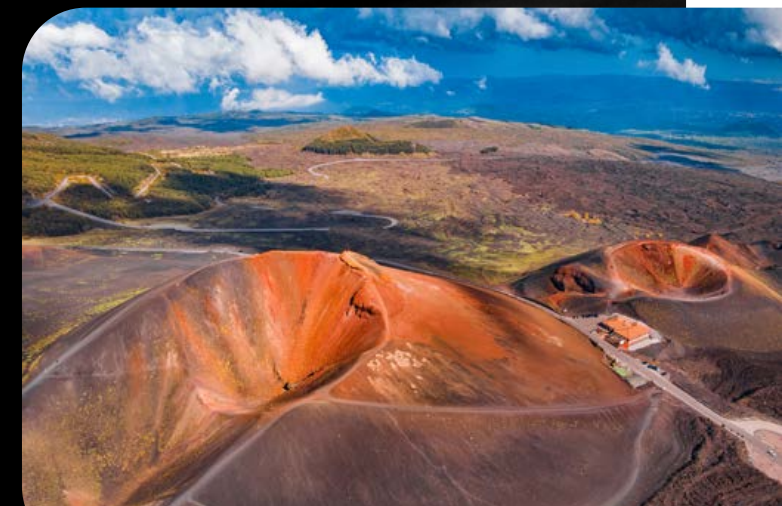
4 X 4 & Cable Car to Mt. Etna

On your way to Pozzallo visit the Valley of Temples in Agrigento – a UNESCO-listed site is one of the the best-preserved Doric temples outside Greece.