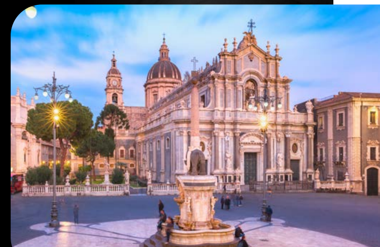
Guided Tour of Catania