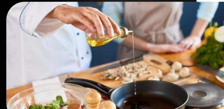
3 Course Lunch & Cooking Class