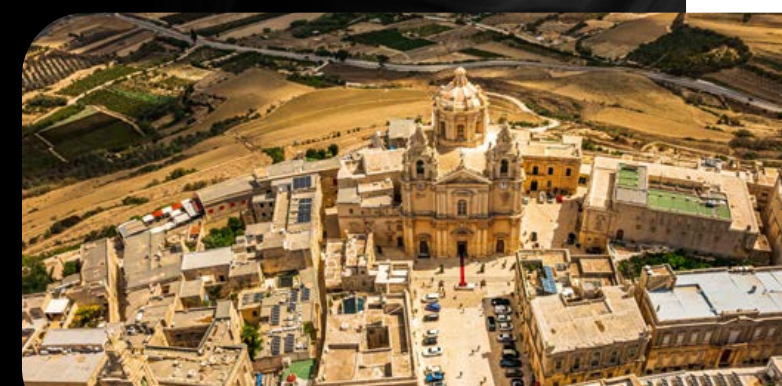
Mdina – The Old Capital