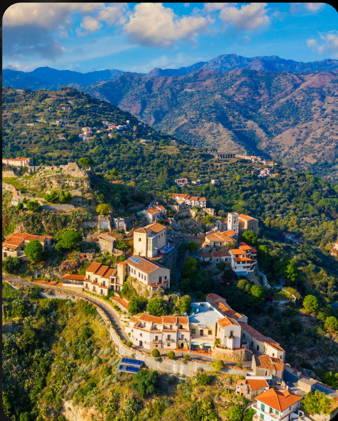
SAVOCA – PART OF GODFATHER TOUR

Your 2 days in Catania will take you on a diverse journey. Besides a Guided tour of Catania - from here visit Mt Etna – at 10,900 Ft this is Europe's highest volcano. Here reach a height of 8200 ft via a 4 X 4 vehicle and a cable car