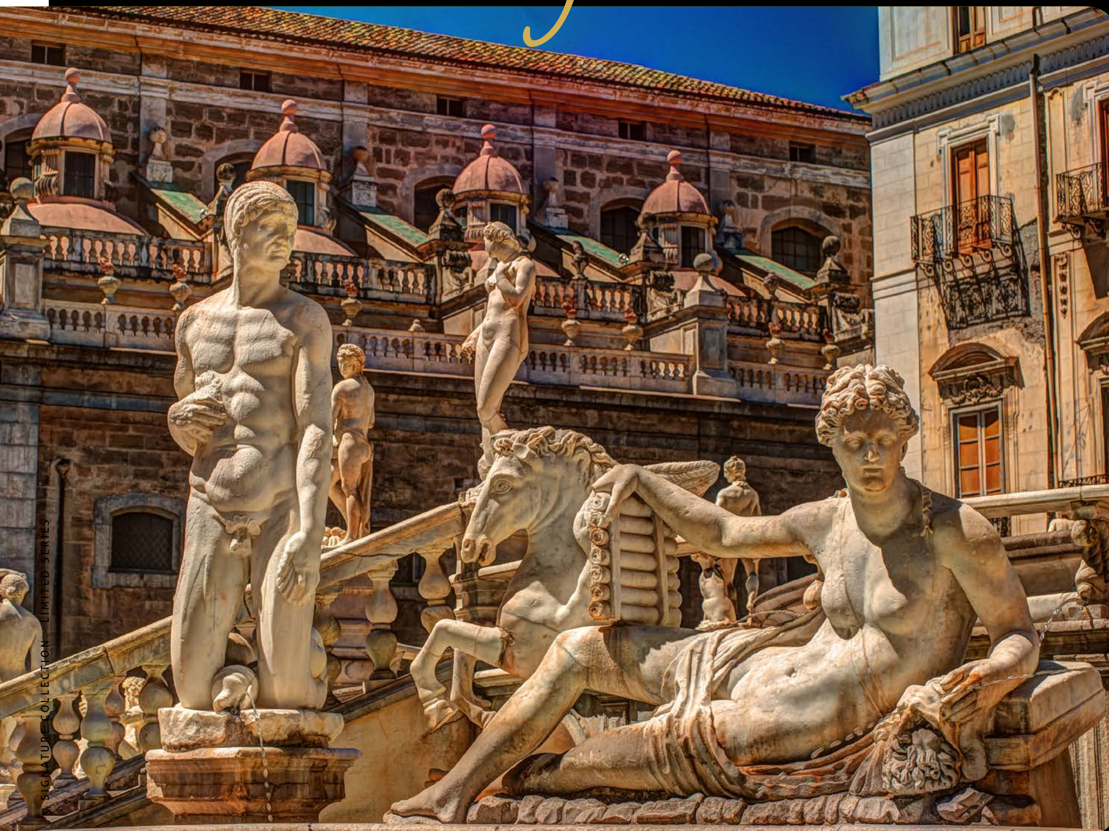
PIAZZA PRETORIA, SICILY