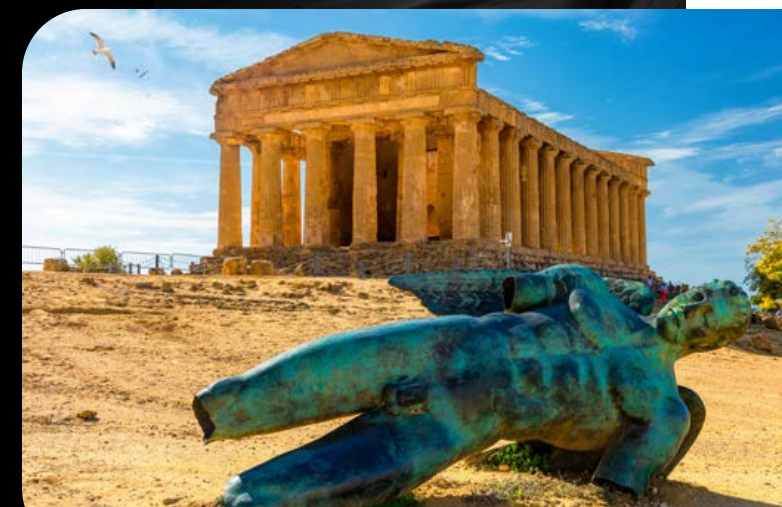
Valley Of Temples, Agrigento