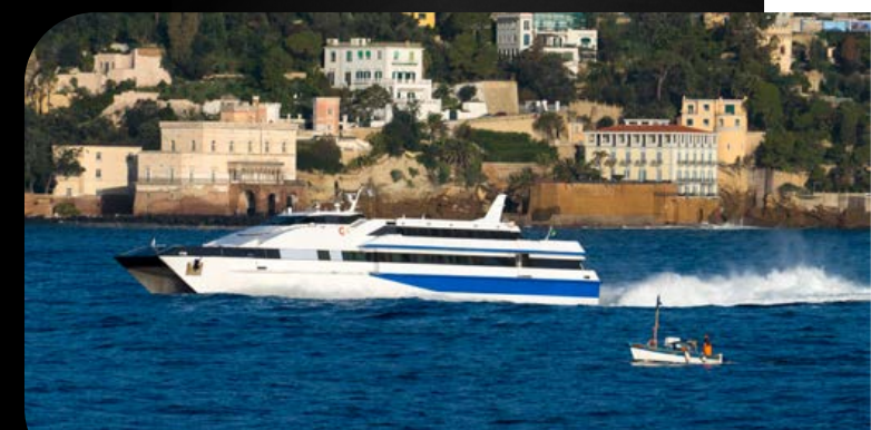
High Speed Ride From Pozzallo to Malta