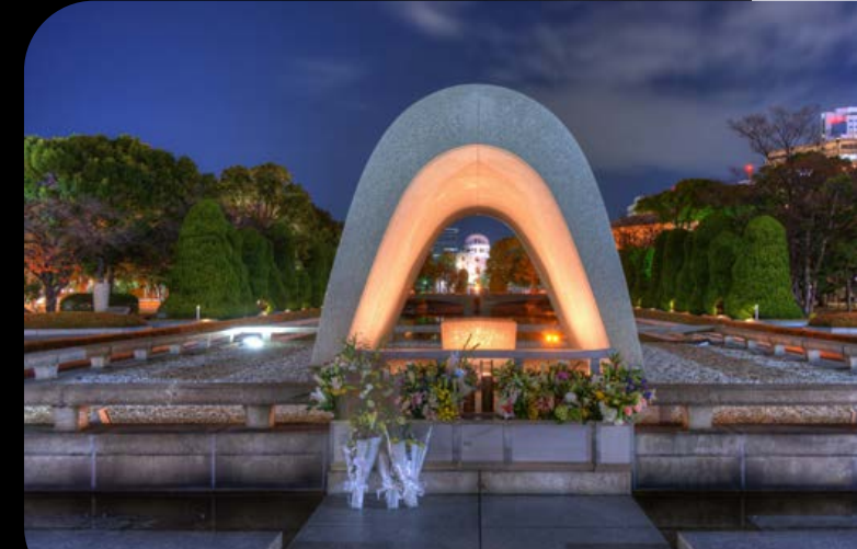
Hiroshima Peace Park

A visit to the Atomic Dome, Hiroshima Peace Park & Museum is a stark reminder of the day Japan faced its war horrors.