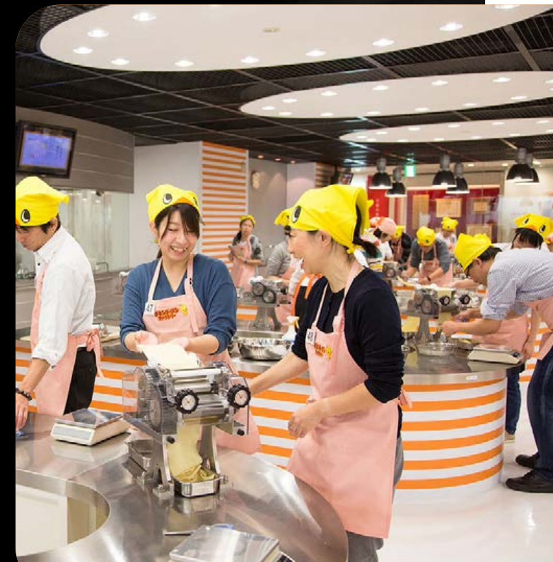
Cup Noodles Factory & Museum

Enjoy the views of Osaka from the iconic Umeda Skywalk.