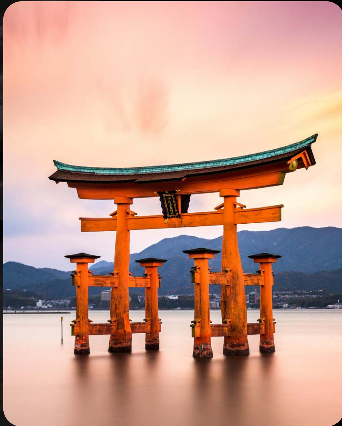
RED TORRI, MIYAJIMA ISLAND

Ride on the Bullet train to Hiroshima. Your experiences in Hiroshima range for the Cultural & Artistic Kagura Show - a traditional performing art which celebrates and expresses gratitude for the bounties of nature. With colourful costumes costing up to ¥2 million– and elaborate masks showing ferocious gods and harrowing demons, Kagura reenacts classic Japanese folklore tales of good versus evil.