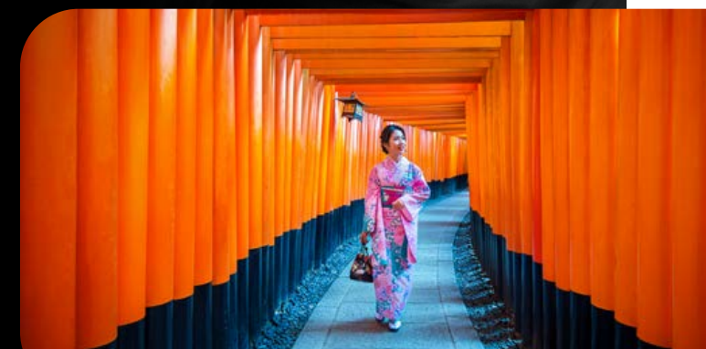
Fushimi Inari Shrine