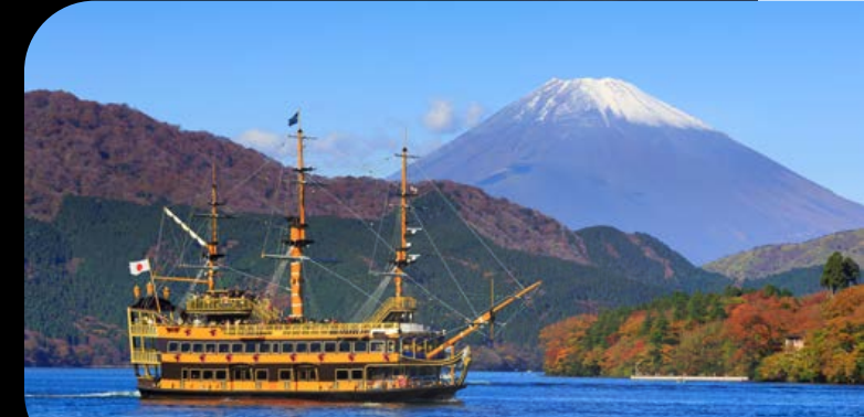
Lake Ashi Cruise

Later, in your hotel enjoy a dip in the traditional Onsen (Hot Spring) with magical views of Mt. Fuji. Enjoy a traditional dinner at the hotel.