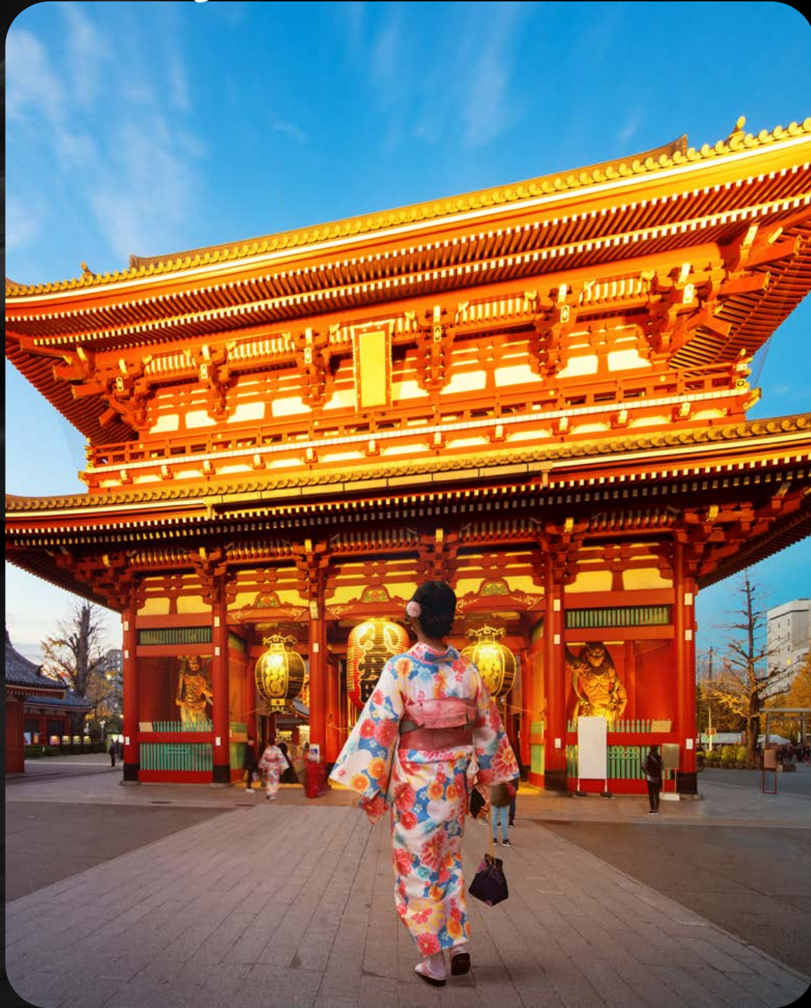
KIMONO EXPERIENCE IN SENSO JI TEMPLE

Your experience in Japan starts with you meeting your chauffeur at the Airport who will drive you in your private car to the hotel. Here, meet your Tour Director who will facilitate your check in (check in time is 1400 hrs).