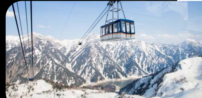
Korube Cable Car

The highlight of this tour is the Snow Corridor which features walls of snow that tower as high as 17 meters over the road. You can also enjoy the Snow Wall Walk.