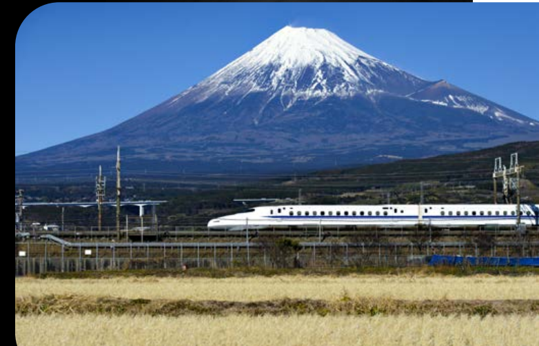
Bullet Train to Hiroshima