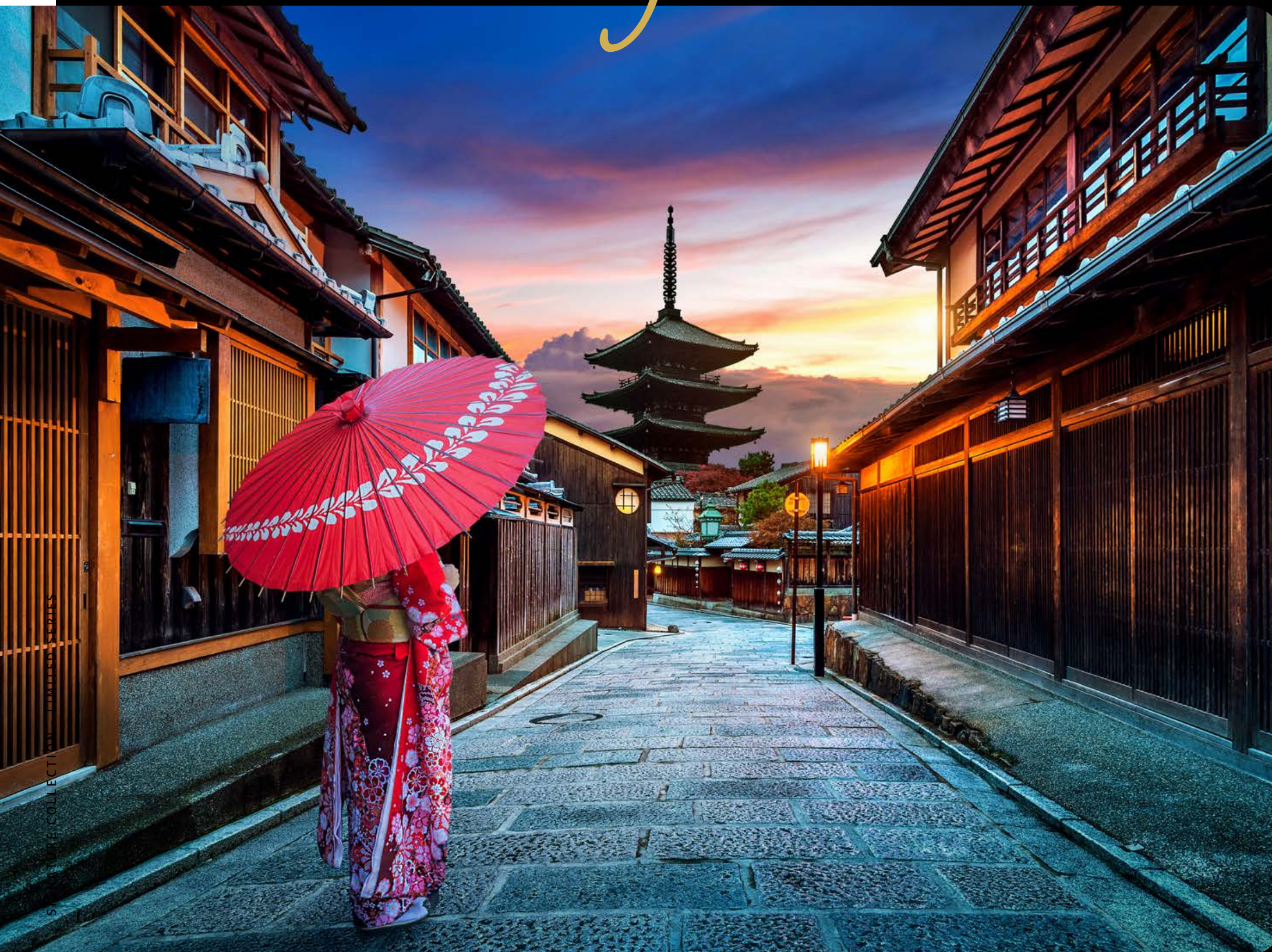
GION DISTRICT, KYOTO