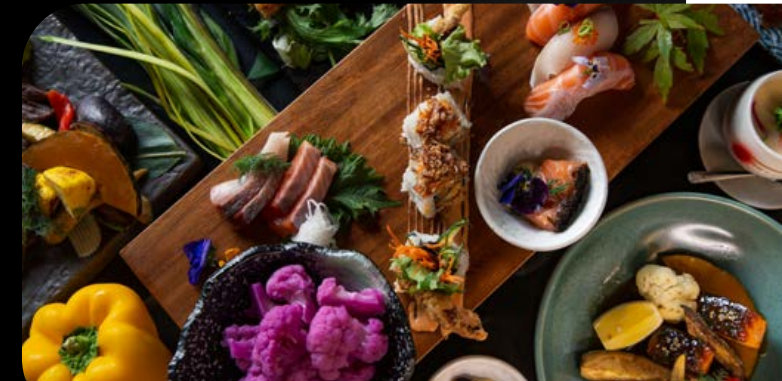
Authentic Japanese Lunch

Visit the Nishi-no-Mon Sake Brewery and learn how this traditional alcoholic beverage is made.