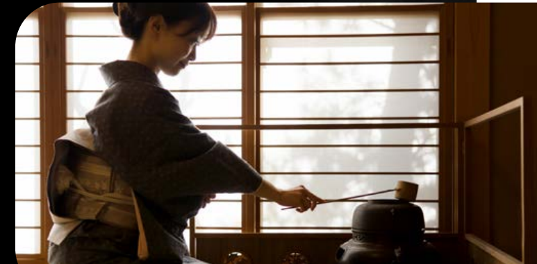
Geisha Tea Experience

In Kyoto, experience the magical Geisha Tea Ceremony and also visit the Samurai & Ninja Museum – where you also see a show, dress like them and also learn the masterful art of Samurai & Ninjas.