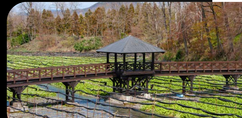
Daio Wasabi Farm