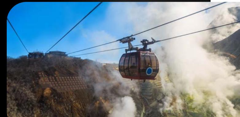
Owakudani Cable Car