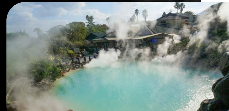
Onsen (Hot Springs)