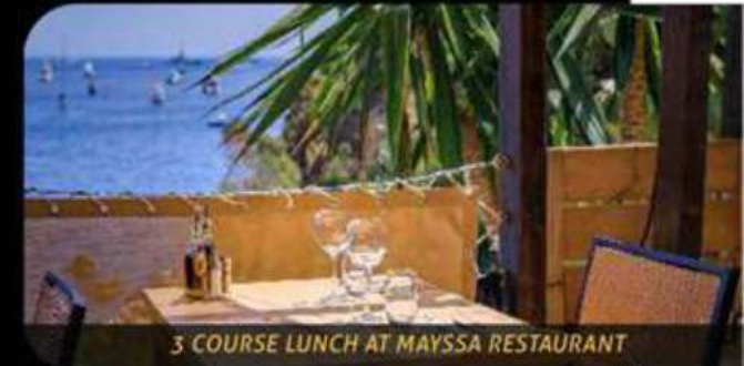
3 COURSE LUNCH AT MAYSSA RESTAURANT