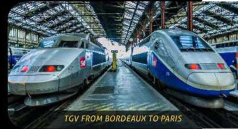
TGV FROM BORDEAUX TO PARIS

No visit to Paris is complete without a visit to the Eiffel Tower (2nd Level) and Montmartre - the city's steepest quarter, and its slinking streets lined with crooked ivy-clad buildings retain a fairy-tale charm. Here, take a funicular to the Upper Station and visit the Sacré-Cœur basilica, an iconic symbol of Paris