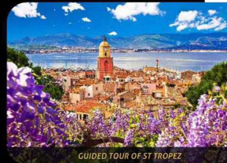
GUIDED TOUR OF ST TROPEZ

In Marseille visit the iconic Notre Dame de la Garde that watches over sailors, fishermen and the entire city. At the Old Port – the heart of Marseille – taste the world-famous French Crepe