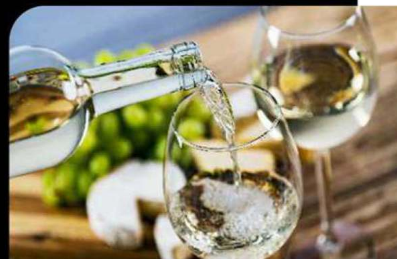
CHÂTEAU PAPE CLÉMENT: 5 SENSES LUXURY WINE EXPERIENCE