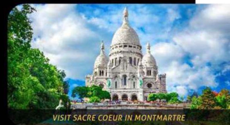
VISIT SACRE COEUR IN MONTMARTRE