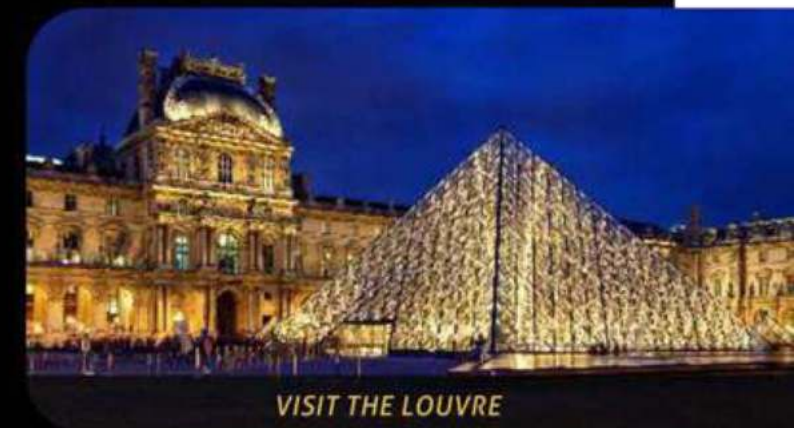
VISIT THE LOUVRE