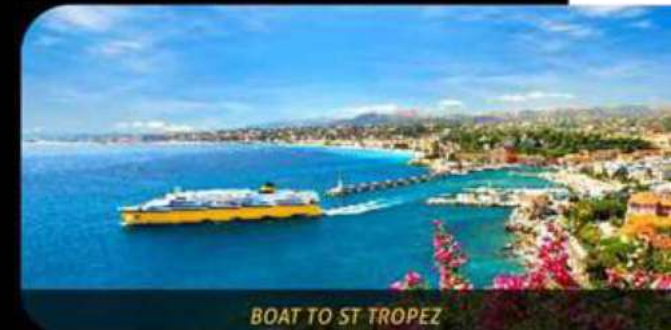
BOAT TO ST TROPEZ