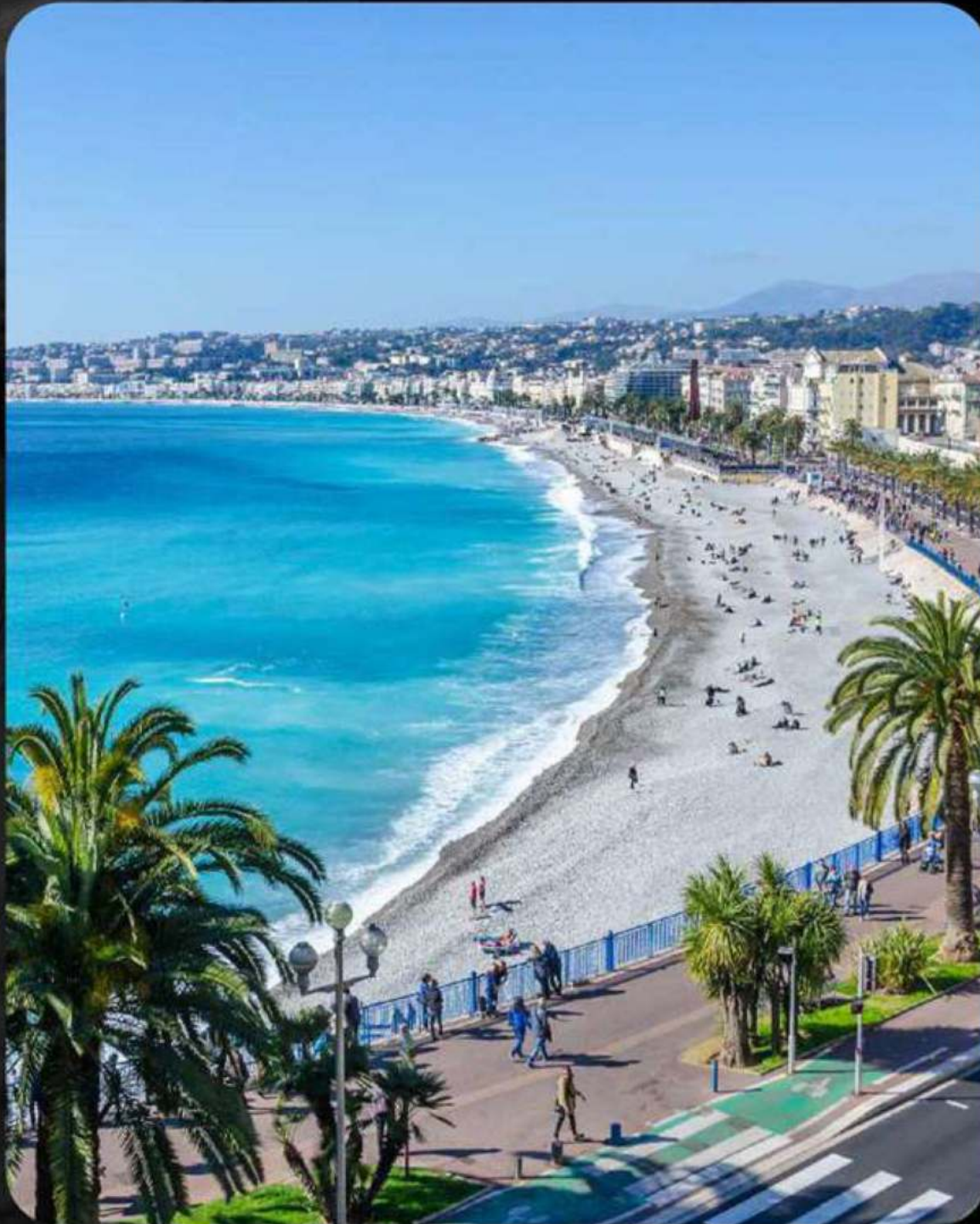
PROMENADE DE ANGLAIS, NICE

Your experience in France starts with you meeting your chauffeur at the Airport who will drive you in your private car to the hotel. Here, meet your Tour Director who will facilitate your check in ( check in time is 1400 hrs).