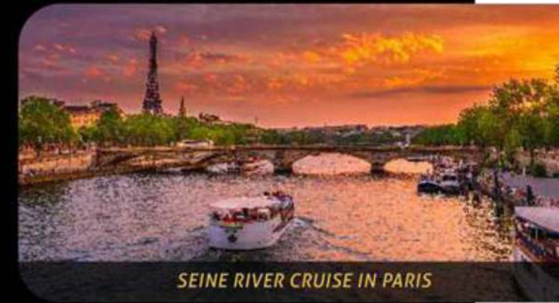
SEINE RIVER CRUISE IN PARIS