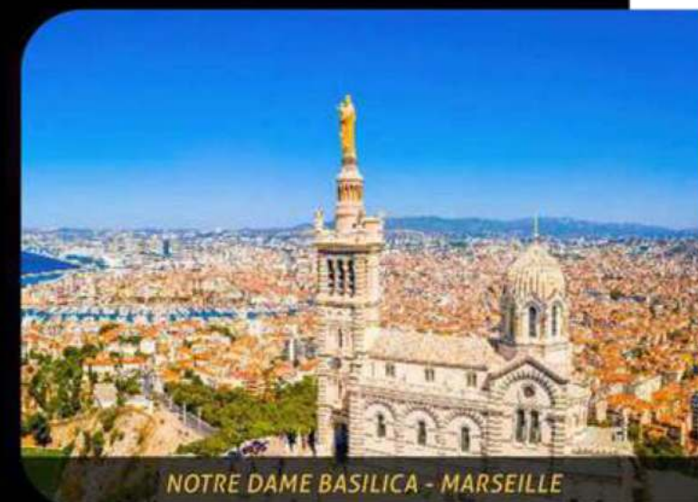
NOTRE DAME BASILICA - MARSEILLE