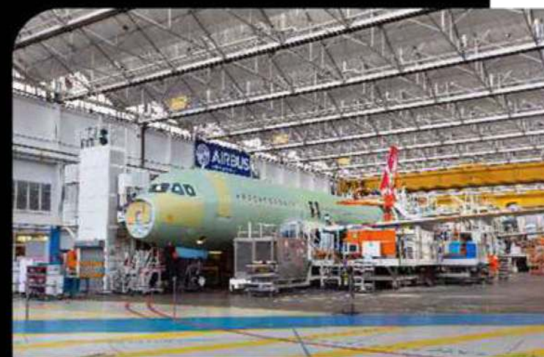
VISIT AIRBUS FACTORY IN TOULOUSE EN ROUTE TO BRODEAUX