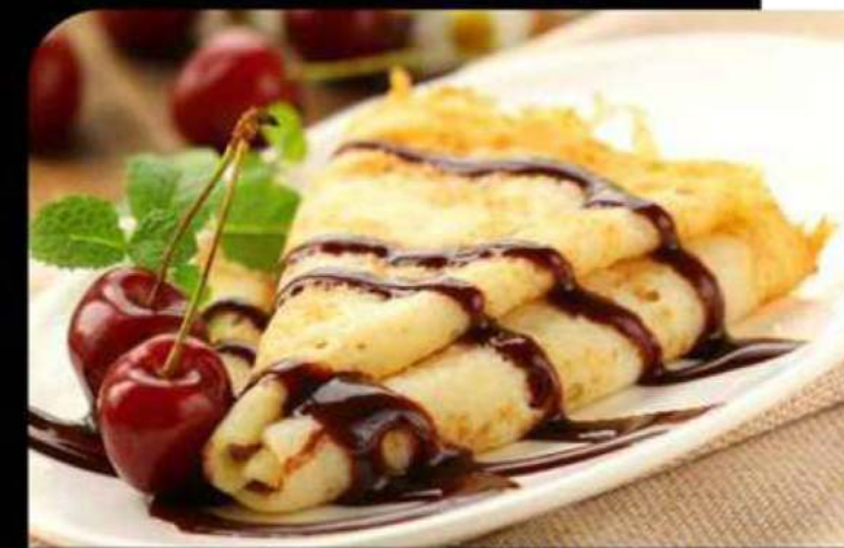
ENJOY A CREPE AT OLD PORT, MARSEILLE