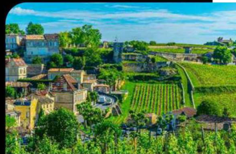
VISIT ST EMILION

In Bordeaux enjoy a guided tour of this magnificent city En route from Marseille to Bordeaux visit and tour the Airbus Factory in Blagnac – on the main factory tour visit the A380 and A350XWB production lines.