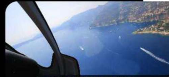
HELICOPTER FROM NICE - MONACO

Your experience will be complete as you take a Boat from Nice to St Tropez