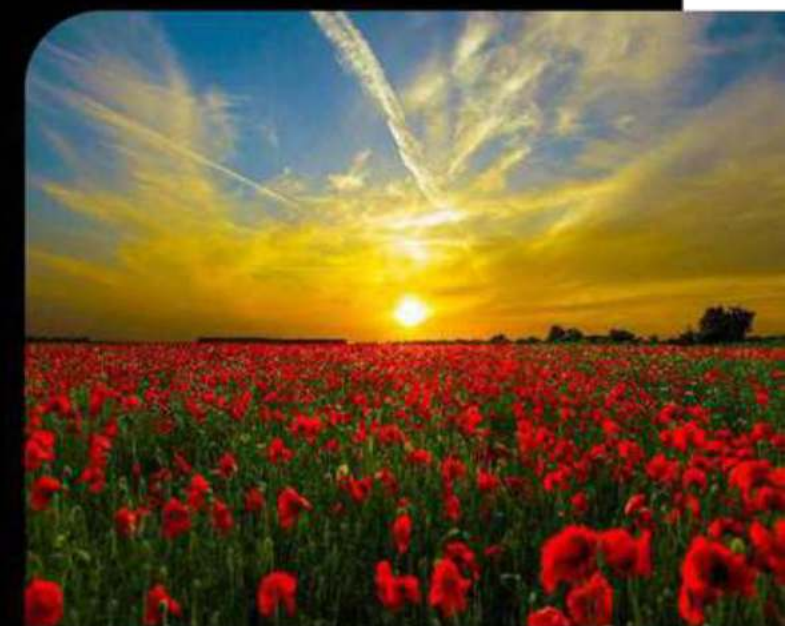
RED POPPY FIELDS IN MAY

Mid-June onwards this region is vibrant with the blooming and dominant Lavender Fields. Your experience will take you to the Lavender Museum and also discover the stunning villages of Sault & Gordes where you will visit the incredibly picturesque Senanque Abbey.