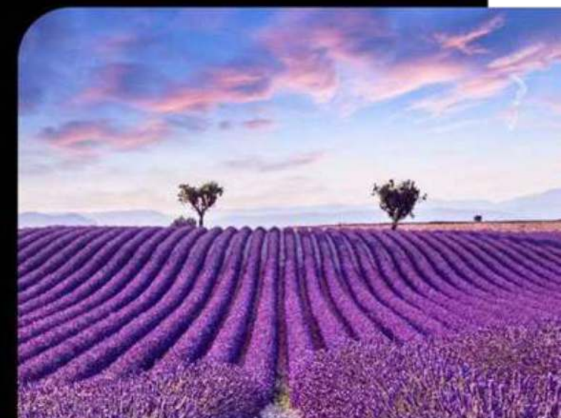
LAVENDER FIELDS IN JUNE