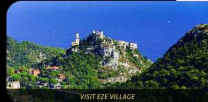
VISIT EZE VILLAGE