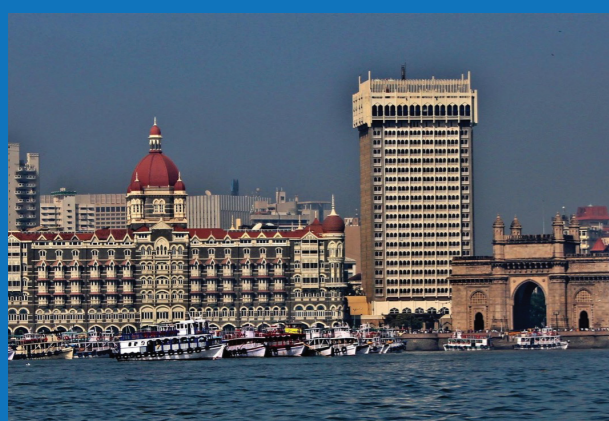
GATEWAY OF INDIA

Mumbai is home to 'Bollywood', the famous Hindi film industry, and has earned itself the reputation of being the 'city where dreams come true'. Many youngsters from all over India and also from abroad flock to this thriving Mecca of Stardom with the hopes of becoming the next big movie star. Mumbai provides the corporate visitor as well as the holidaying tourist the right ambience and all the accompanying facilities, to make a visit they will always cherish.