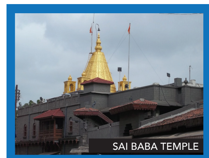
SAI BABA TEMPLE

This religious town is about 296 kms from Mumbai and best known as the home of the popular Guru Sai Baba. It is one the richest temple organisations in India. On any given day this pilgrim centre over 25000 devotees visit here; and on holidays over half a million people come here to visit. The two most famous temples here are the Shani Shingnapur Temple and the Sai Baba temple.