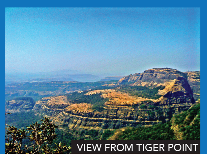
VIEW FROM TIGER POINT

Located about 96 kilometers from Mumbai, Lonavala is known for its beautiful hills and waterfalls, and also for its famous 'chikki' and fudge. Like other hill stations in Maharashtra, here too you will find 'points' that offer breathtaking sights of the valley and the hills with tiny villages tucked in the folds.