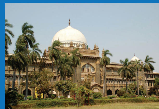
PRINCE OF WALES MUSEUM

SOME GREAT GETAWAYS NOT FAR FROM THE CITY INCLUDE: