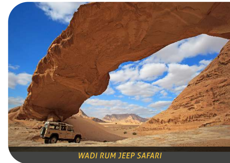
WADI RUM JEEP SAFARI

After your breakfast at the camp, proceed to the Ma'in Hot Springs, the most famous thermal spring in the hills above the Dead Sea. The thermal mineral hot springs and waterfalls, where Herod the Great was said to have bathed in its medicinal water, and where people have come for thermal treatments, or simply to enjoy a hot soak Later, drive to the Dead Sea – the lowest pint on Earth. Overnight in Dead Sea Area. (B, L, D)