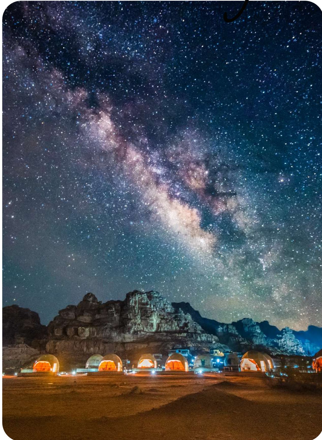
Wadi Rum Star Gazing