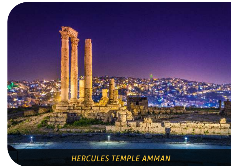
HERCULES TEMPLE AMMAN

After buffet breakfast at the hotel, check-out and drive in your private vehicle to Petra. Explore the legendary rose-red city of Petra – known as the New Wonder of the World and a UNESCO World Heritage Site. Enter the city through 1KM long narrow gorge which is flanked either side by 80m high cliffs! Notice the dazzling colours and formations of the rocks. The site is massive, and contains hundreds of elaborated rock-cut tombs, a treasury, Roman-style theatres, temples, sacrificial altars and colonnaded streets. Later, experience Petra by Night. You will walk along the Siq lit up by the light of 1,800 candles- a sight truly out of this world! Overnight in Petra. (B, LL,D)