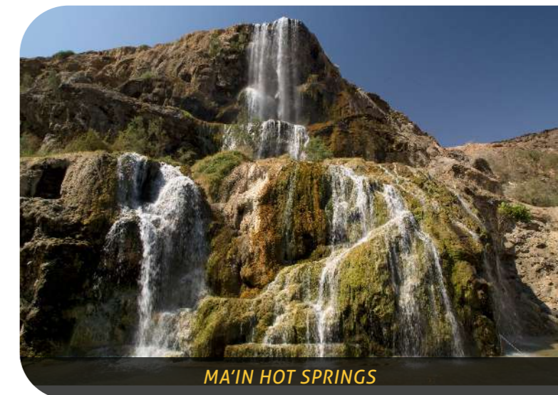
MA'IN HOT SPRINGS