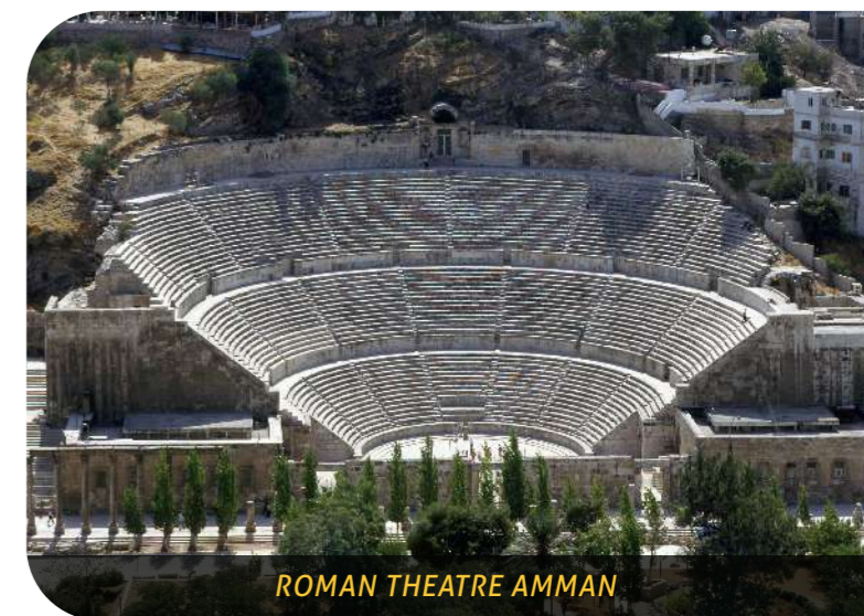
ROMAN THEATRE AMMAN