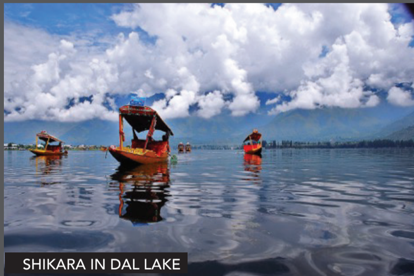
SHIKARA IN DAL LAKE