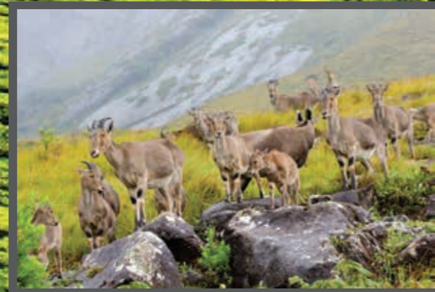
Eravikulam National Park