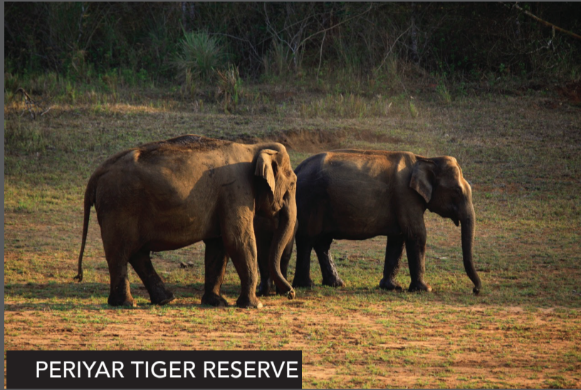
PERIYAR TIGER RESERVE